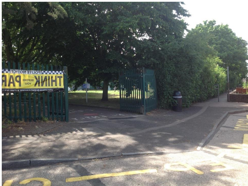
Carpark exit showing public footpath