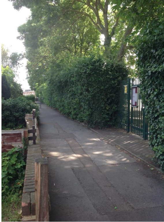
Public footpath with pedestrian entrance and exit to playground