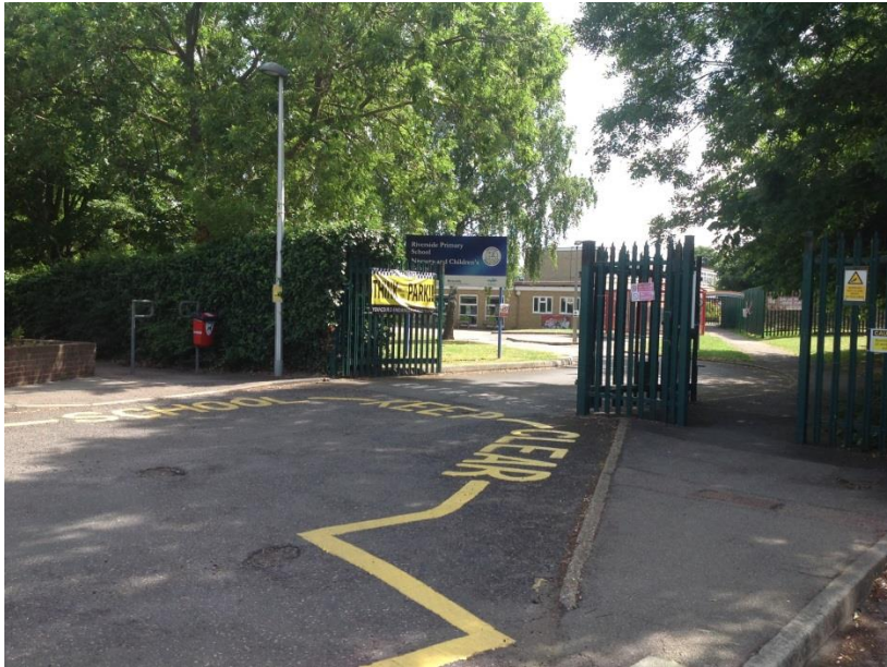
Vehicle and pedestrian entrance to carpark, showing public footpath to the left