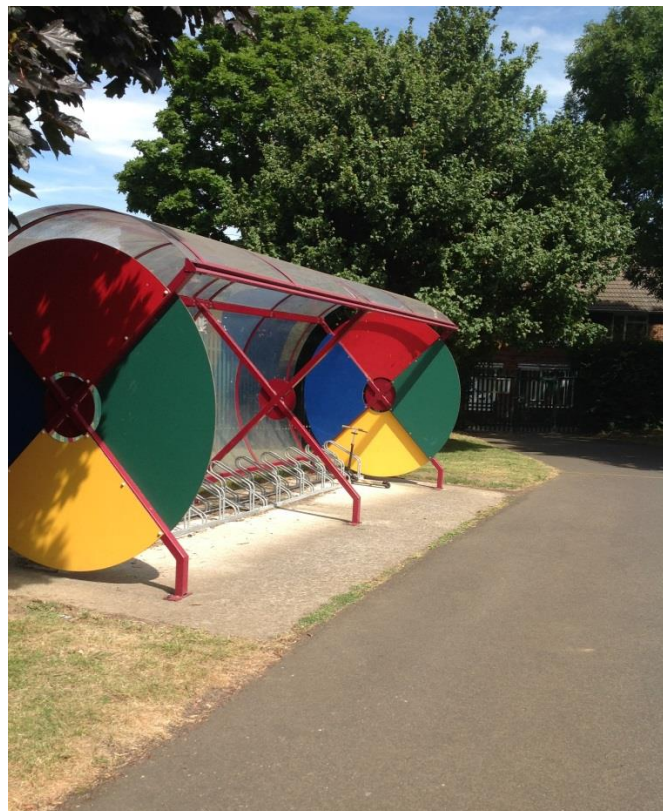
Cycle & scooter storage for pupils and staff